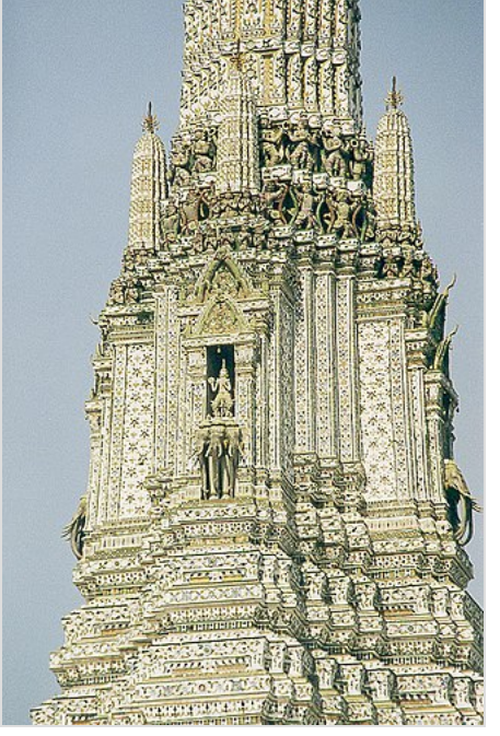
Wat Arun Phra Prang, source of B.Grimm's logo

Eighty-five percent of B.Grimm's production capacity is gas powered <u>combined cycle cogeneration</u> plants. However, B.Grimm has expanded their renewable generation (wind, <u>solar</u>, <u>hydro</u>) and are on track to double capacity within the next few years.<sup>[14]</sup> Another five power plants in Thailand are under development, as